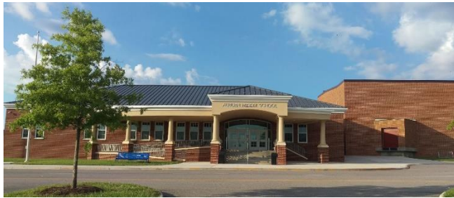
Auburn Middle School

Eastern Montgomery Elementary School.....Shawsville Middle School