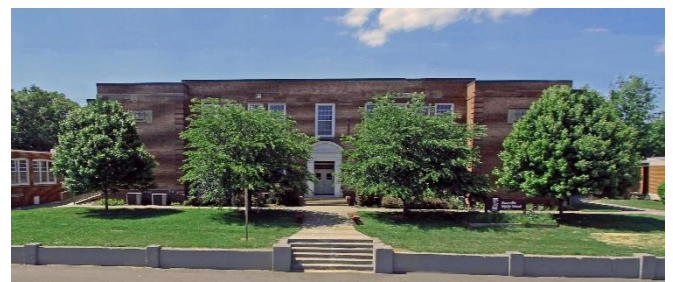
Shawsville Middle School