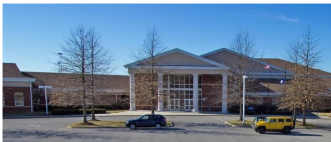
Christiansburg Middle School