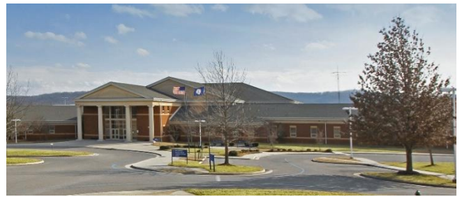
Blacksburg Middle School